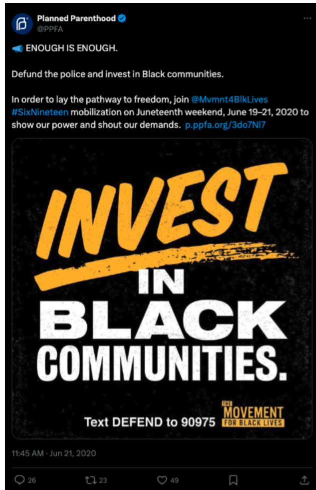
(Planned Parenthood, Twitter , 6/21/20)