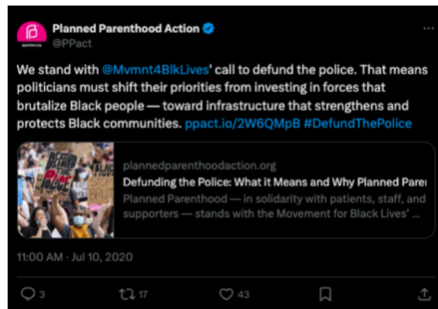
(Planned Parenthood Action, Twitter , 7/10/20)

In July 2020, Planned Parenthood Action Fund Tweeted That They Stood With Black Lives Matter And Their Calls To Defund The Police. “We stand with @Mvmnt4BlkLives' call to defund the police. That means politicians must shift their priorities from investing in forces that brutalize Black people — toward infrastructure that strengthens and protects Black communities.” (Planned Parenthood Action, Twitter , 7/10/20)