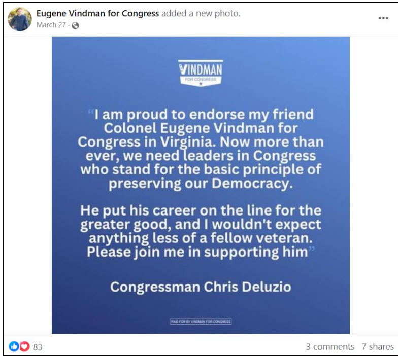
(Eugene Vindman For Congress, Facebook , 3/27/24)