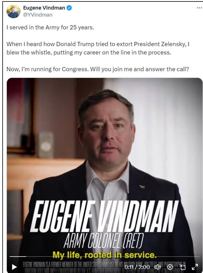
(Eugene Vindman, Twitter , 2/3/24)