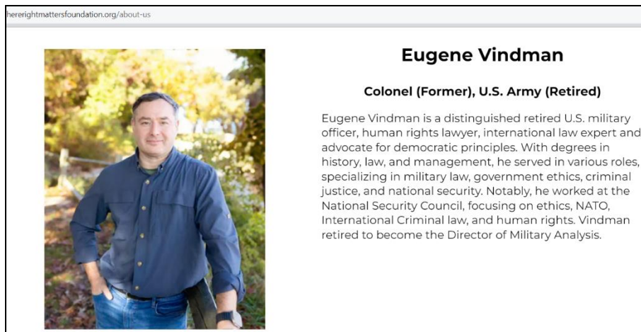
(“About Our Founders,” Here, Right Matters Foundation , Accessed 5/8/24)

According To The Here, Right Matters Foundation’s Website Biography Of Eugene Vindman, “Eugene Vindman “Colonel (Former), U.S. Army (Retired). “Eugene Vindman is a distinguished retired U.S. military officer, human rights lawyer, international law expert and advocate for democratic principles. With degrees in history, law, and management, he served in various roles, specializing in military law, government ethics, criminal justice, and national security. Notably, he worked at the National Security Council, focusing on ethics, NATO, International Criminal law, and human rights. Vindman retired to become the Director of Military Analysis.” (“About Our Founders,” Here, Right Matters Foundation , Accessed 5/8/24)