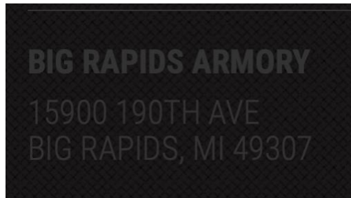
(Locations, Michigan Army National Guard , Accessed 3/29/23)