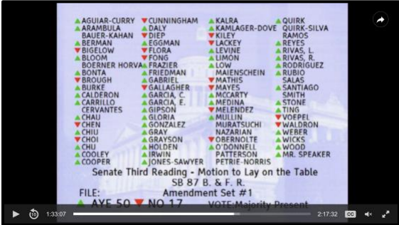
(SB87, Assembly Floor Session, California State Assembly , 1:33:07, 06/17/19)