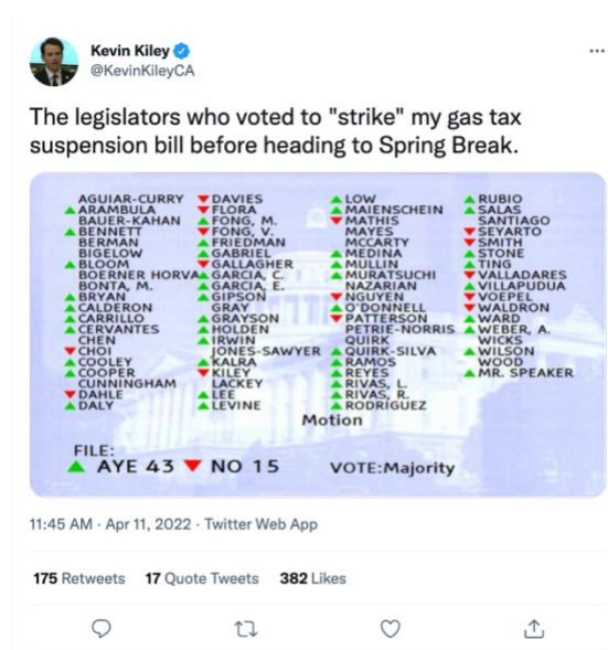
(Kevin Kiley Twitter, 04/11/22)