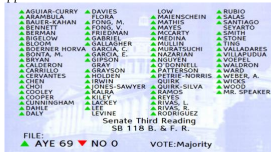
(Media Archive, Assembly Floor Session, California State Assembly , 03/14/22) (1:20:13)