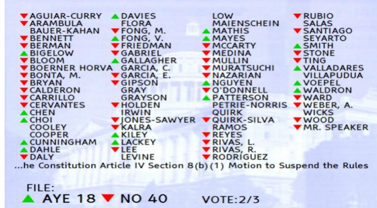
(Media Archive, Assembly Floor Session, California State Assembly , 03/14/22) (1:26:41)