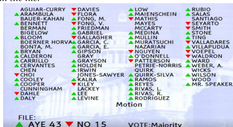
(Assembly Floor Session, California State Assembly , 04/07/22) (45:29)