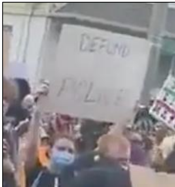
(Lonn Chalant, Twitter , 6/5/20)