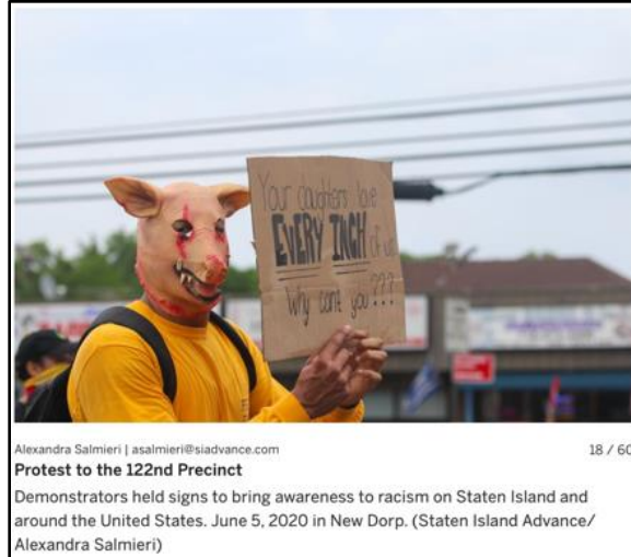
18 / 60 Protest to the 122nd Precinct Demonstrators held signs to bring awareness to racism on Staten Island and around the United States. June 5, 2020 in New Dorp.