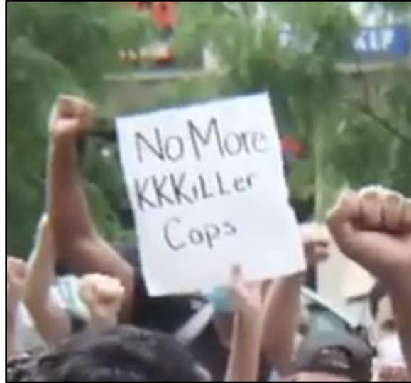
(Jonmariansi, Twitter , 6/5/20)