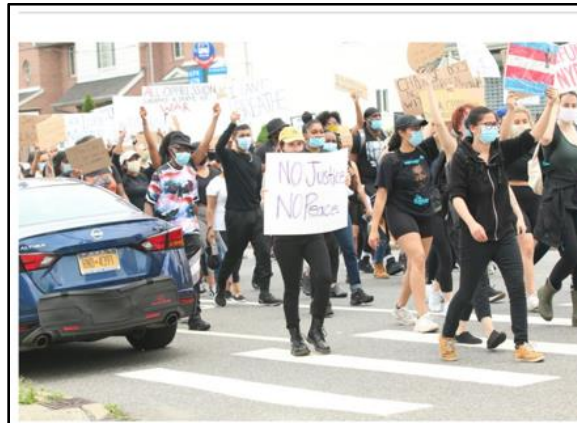
50 / 60 Rally to 122 Protesters march to the 122 precinct through Dongan Hills along Richmond Road.