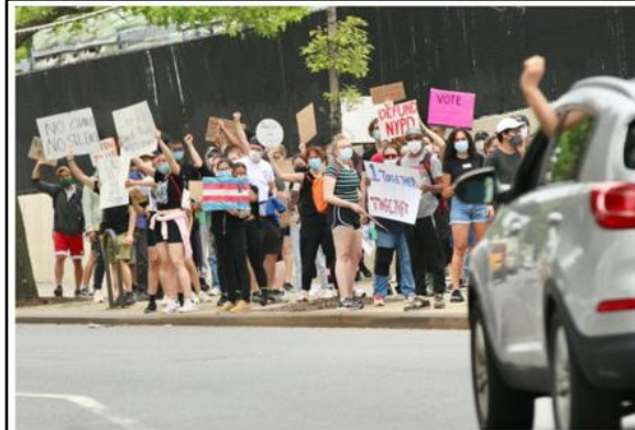
54 / 60 George Floyd rally Number grow in Concord as protesters get ready to march to the 122 Precinct in New Dorp.