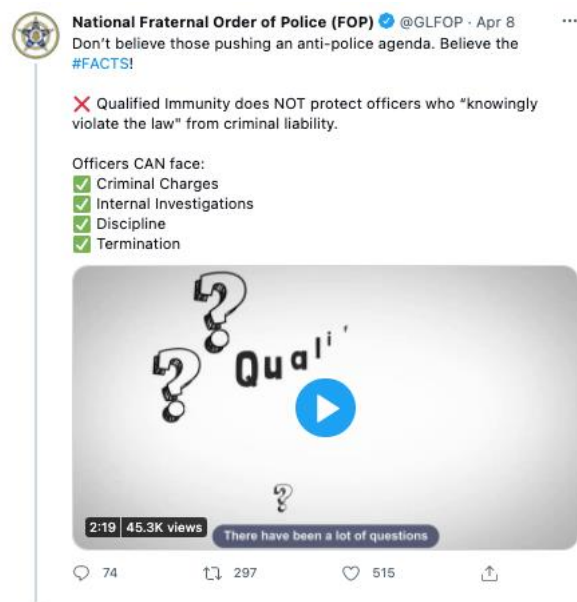
(National Fraternal Order Of Police, Twitter , 4/8/21)

The Fraternal Order Of Police Charged That Ending Qualified Immunity Was Anti-Police. “Don’t believe those pushing an anti-police agenda. Believe the #FACTS! ❌ Qualified Immunity does NOT protect officers who ‘knowingly violate the law’ from criminal liability. Officers CAN face: ✅ Criminal Charges ✅ Internal Investigations ✅ Discipline ✅ Termination ...” (National Fraternal Order Of Police, Twitter , 4/8/21)