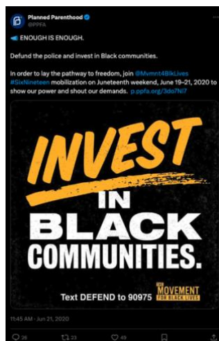
(Planned Parenthood, Twitter , 6/21/20)

Planned Parenthood Federation Of America Called For Defunding The Police. (Planned Parenthood, Twitter , 6/21/20)