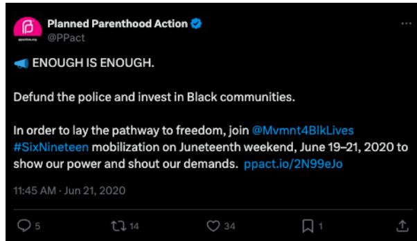
(Planned Parenthood Action, Twitter , 6/21/20)

In July 2020, Planned Parenthood Action Fund Tweeted That They Stood With Black Lives Matter And Their Calls To Defund The Police. “We stand with @Mvmnt4BlkLives' call to defund the police. That means politicians must shift their priorities from investing in forces that brutalize Black people — toward infrastructure that strengthens and protects Black communities.”