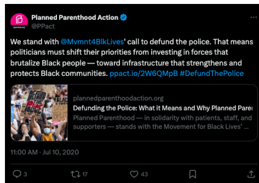
(Planned Parenthood Action, Twitter , 7/10/20)

Planned Parenthood Federation Of America Called For Defunding The Police. (Planned Parenthood, Twitter , 6/21/20)