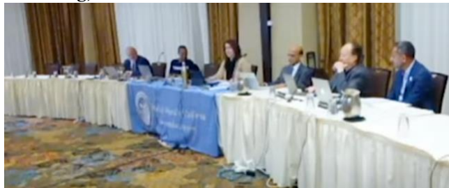
(Webcast, Medical Board of California , 01/30/20)