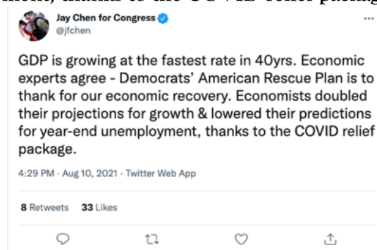
(Jay Chen Twitter, 08/10/21)