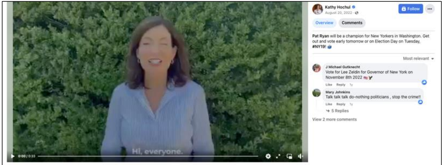
(Kathy Hochul, Facebook , 8/20/22)

HOCHUL: “Hi, everyone. We have a really important special election in the 19th congressional district in the Hudson Valley. I need you to get out there and support my great friend Pat Ryan. I’ve known him and worked with him for years as county executive. He’s a smart guy. He’s a veteran. He’s out there fighting for our families. And I want him as my partner in Washington. So get out there. You can early vote until Sunday or make sure you cast your vote for Pat Ryan for Congress in the special election, this Tuesday the 23rd. Don’t let me down.” (Kathy Hochul, Facebook , 8/20/22)