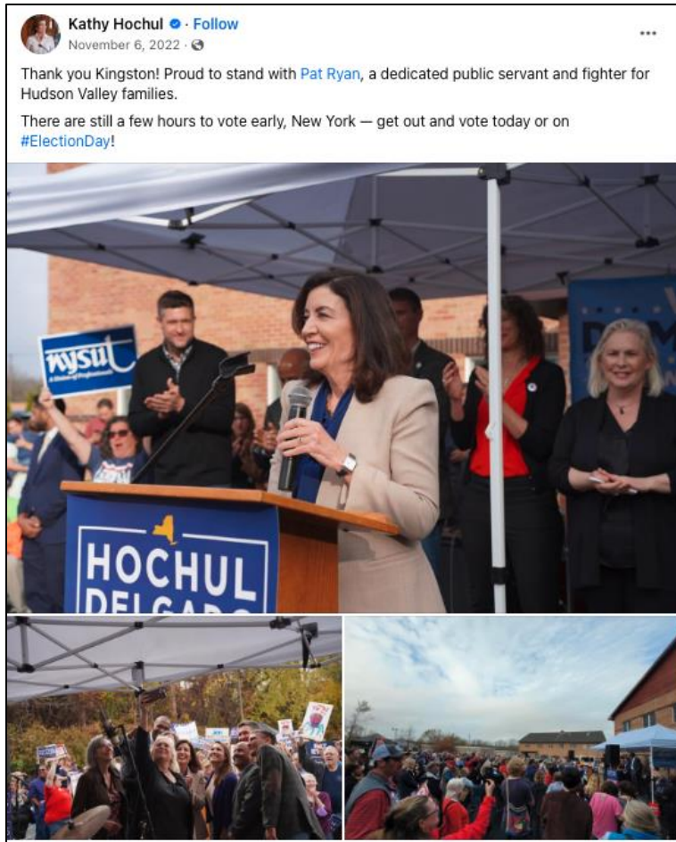
(Kathy Hochul, Facebook , 11/6/22)

On August 22, 2022, Hochul Said Ryan Was “The Champion We Need Fighting For Us In Congress,” And Encouraged Her Followers To Support Him In His Election. “Pat Ryan is the champion we need fighting for us in Congress. Let’s get him elected tomorrow, #NY19!” (Kathy Hochul, Facebook , 8/22/22)