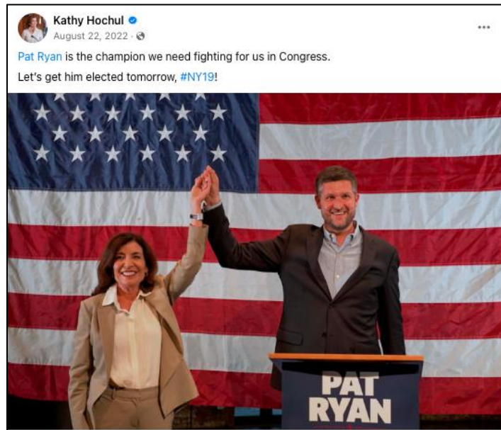
(Kathy Hochul, Facebook , 8/22/22)

On August 22, 2022, Hochul Said Ryan Was “The Champion We Need Fighting For Us In Congress,” And Encouraged Her Followers To Support Him In His Election. “Pat Ryan is the champion we need fighting for us in Congress. Let’s get him elected tomorrow, #NY19!” (Kathy Hochul, Facebook , 8/22/22)