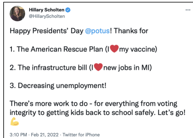
(Hillary Scholten, Twitter , 2/21/22)