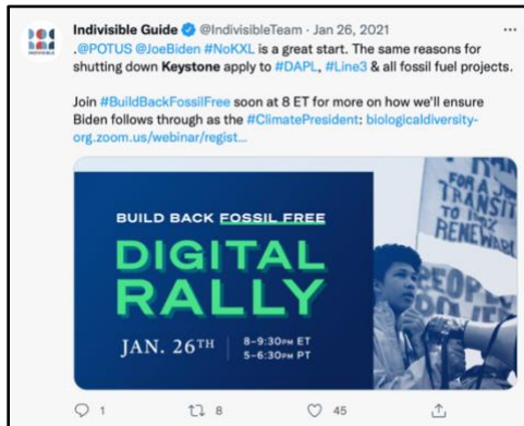
(Indivisible, Twitter , 1/26/21)