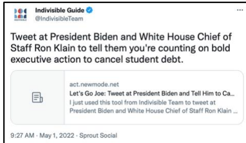
(Indivisible, Twitter , 5/1/22)