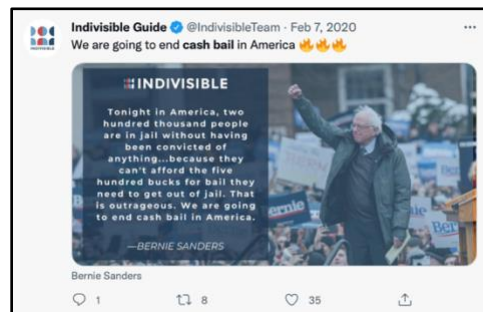
(Indivisible, Twitter , 2/7/20)