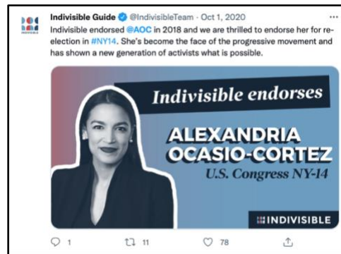
(Indivisible, Twitter , 10/1/20)