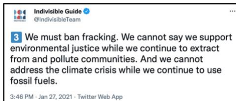
(Indivisible, Twitter , 1/27/21)