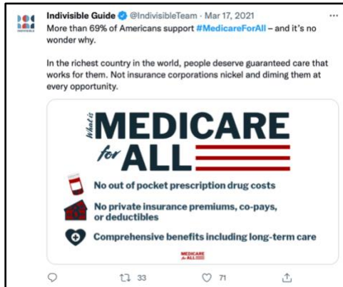
(Indivisible, Twitter , 3/17/21)