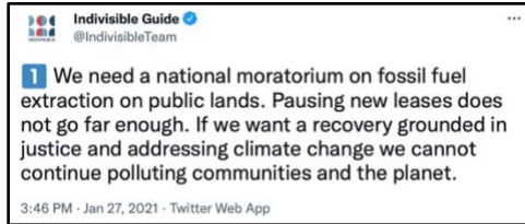
(Indivisible, Twitter , 1/27/21)