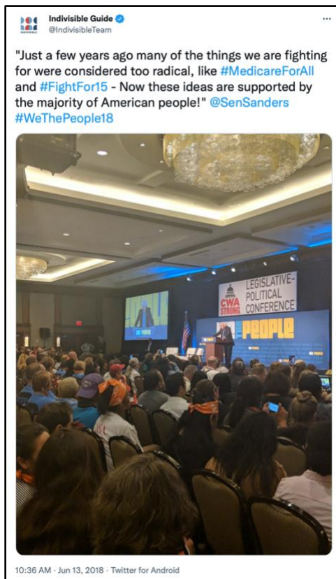
(Indivisible, Twitter , 6/13/18)