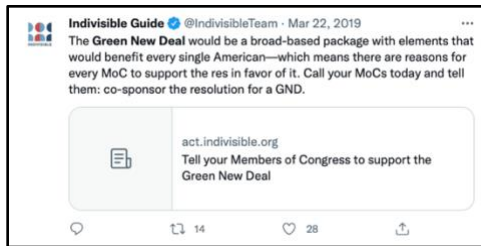
(Indivisible, Twitter , 3/22/19)