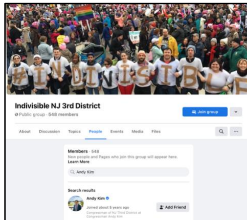
(Indivisible NJ 3 rd District, Facebook , Accessed 12/27/21)