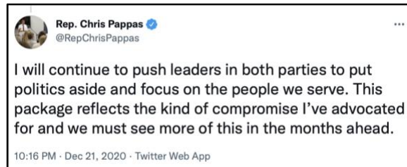
(Rep. Chris Pappas, Twitter , 12/21/20)