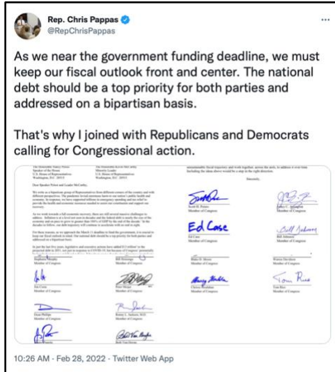
(Rep. Chris Pappas, Twitter , 2/8/22)